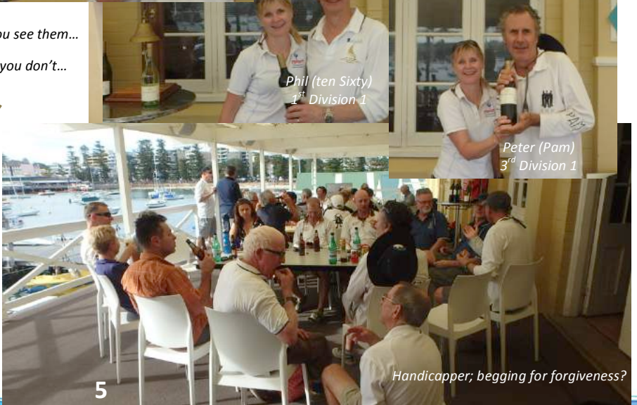
Handicapper; begging for forgiveness?