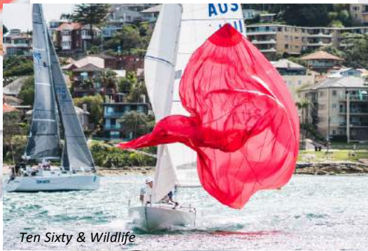
Ten Sixty & Wildlife