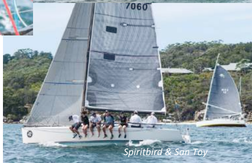
Spiritbird & San Toy