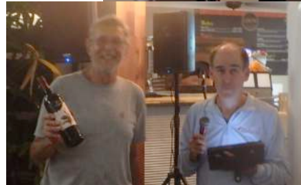
A great day's sailing, and a great turnout at RMYC with friends and family joining the fleet